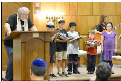
Religious school Shabbat ser- vice, Oct 5.