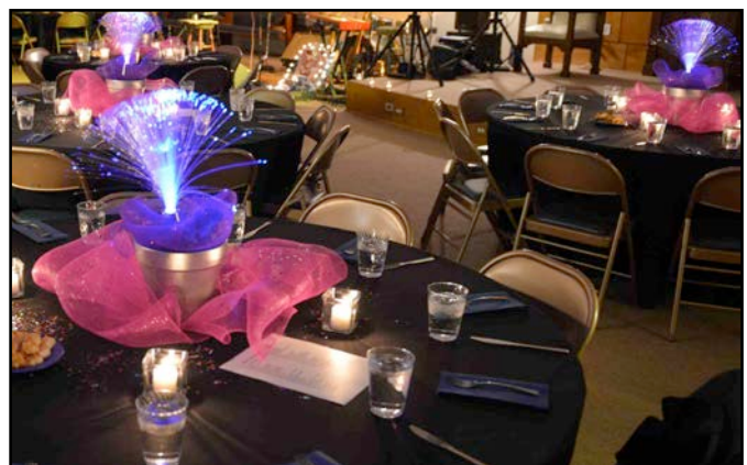
The Temple glowed with Sisterhood's decorations for a memorable Brisket and Blues night on March 9 th .

The University of Alabama Department of Religious Studies, 212 Manly Hall Box 870264, Tuscaloosa, AL 35487-0264 (205) 348-0473 E-mail sjacobs@bama.ua.edu